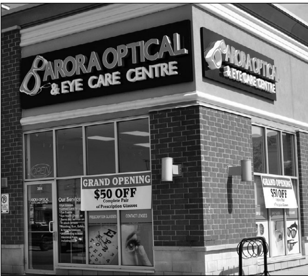
Arora Optical is located at 3161 Strandherd Drive (at Woodroffe).

The Barrhaven Business Profile is brought to you by the Barrhaven BIA. We encourage you to shop locally and support the businesses that create jobs and support so many organizations and events in our wonderful community. For more on all of the great things Barrhaven has to offer, visit discoverbarrhaven.com and follow us on Twitter at @barrhavenbia.